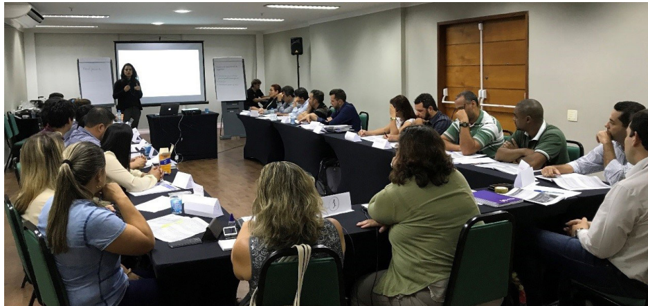
Harsco employees in Brazil participate in intensive Environmental 101 training.

In 2016, over 75 members of Harsco leadership received training through our “Environmental 101” course. This course covers air, water and land impacts and assessment, environmental management systems, energy management, lifecycle assessment, stakeholder analysis,