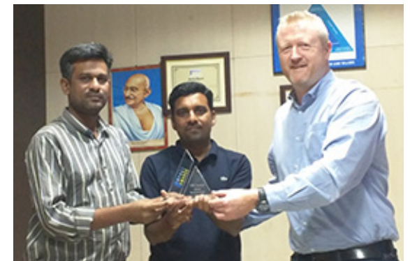
A 2016 Harsco Impact Award is presented to our Metals & Minerals site in Bellary, India.

► 2016 marked the second year of Harsco's companywide peer-recognition program, the Impact Awards. These awards provide every Harsco employee the opportunity to nominate his or her exceptional colleagues, in categories that reflect our core business values. Over 100 employees and teams (from across every business, region and function) were singled out by their coworkers as representative of the very best of Harsco.